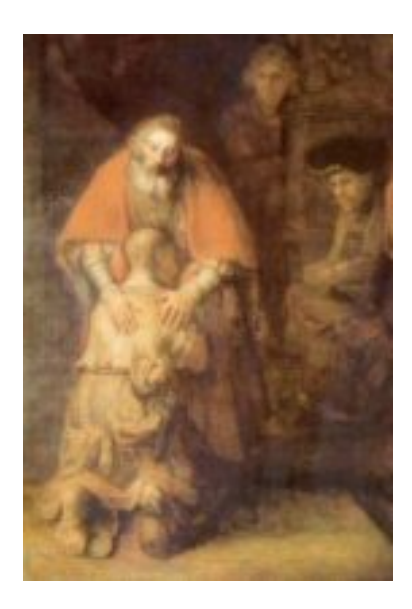
The Prodigal Son

Baptized Christians in irregular marriages may celebrate the Rite of Welcoming the Candidates ( RCIA , nn. 411-433), but they are not to celebrate the Rite of Calling to Continuing Conversion ( RCIA , nn. 446-458_) until any and all marriage cases have been processed and completed by the Diocesan Tribunal. If these optional rites are not celebrated, baptized Christians in irregular marriages cannot be received into the full communion of the Catholic Church (with the celebration of confirmation and Eucharist) until any and all marriage cases have been properly processed and completed by the Diocesan Tribunal.